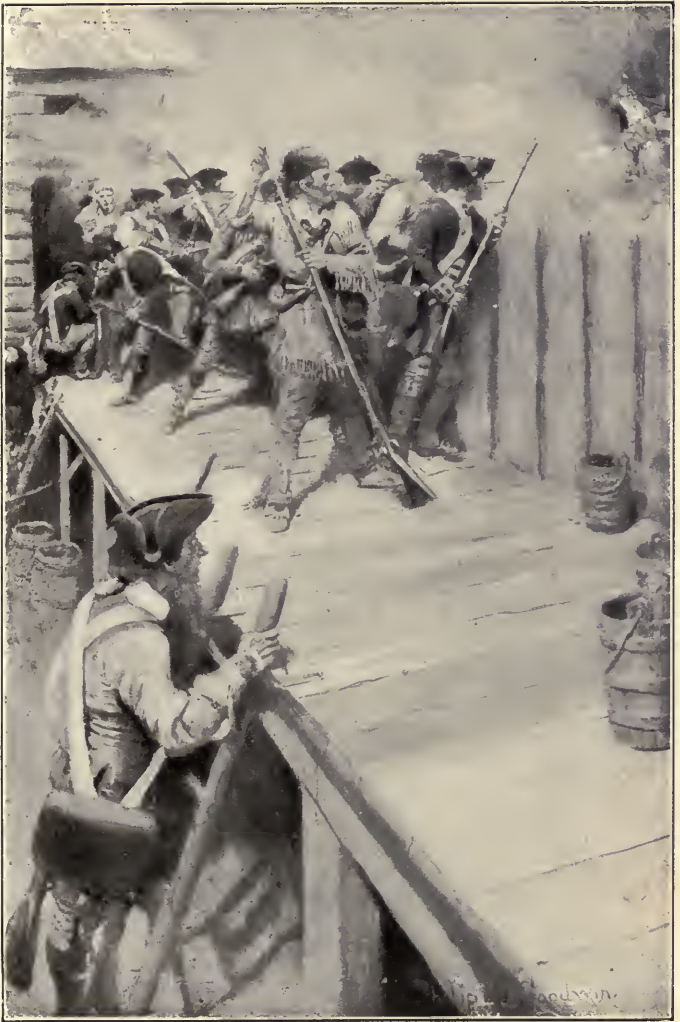
“‘THEY’VE HIT HIM,’ SAID MOUNT, RELOADING HASTILY”